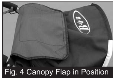
Fig. 4 Canopy Flap in Position